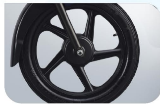
Sporty Alloy Wheels