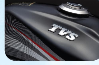
Premium 3D Logo