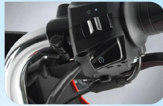
One Touch Electric Start*