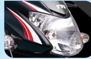
Sporty Headlamp & Tail lamp