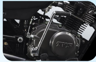
100cc Duralife Engine